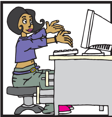
Post Hike EduClub ....

"wow, there's a lot of benefits to be an eduenturer! "