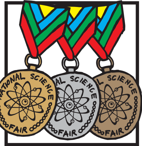
In Namibia there is a science competition.... all three win medals for their science projects.

"doing this science project is so much fun!"