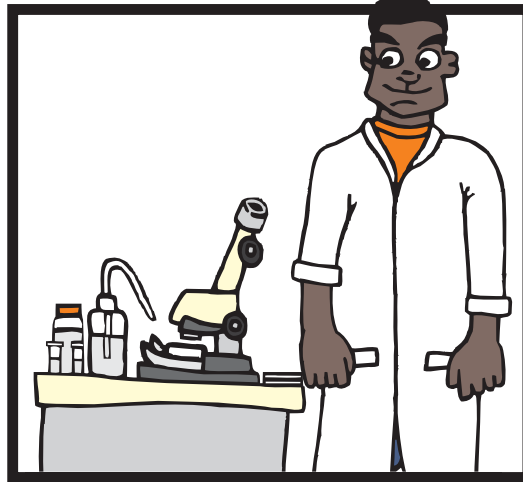
Post Hike Science EduVentures ....

"wow, there's a lot of benefits to be an eduenturer! "