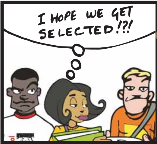
The selection process starts....A visit to the museum, a tough pre-hike and a nerve-racking interview....