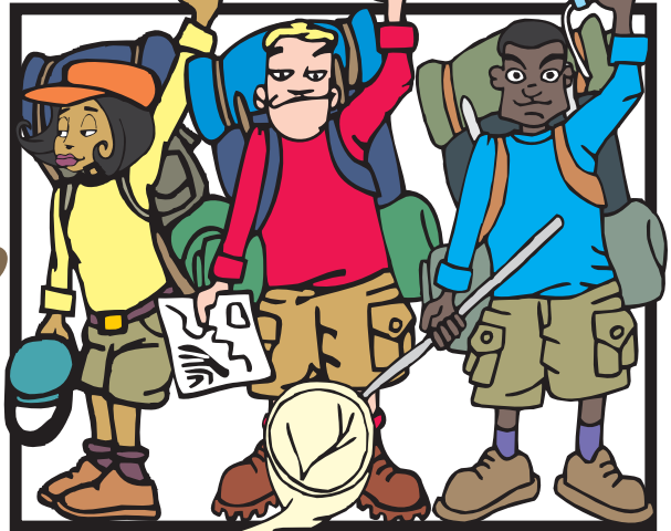
2 weeks of hiking...mapreading...little water...no washing...collecting spiders, scorpions, insects, reptiles, etc, etc....